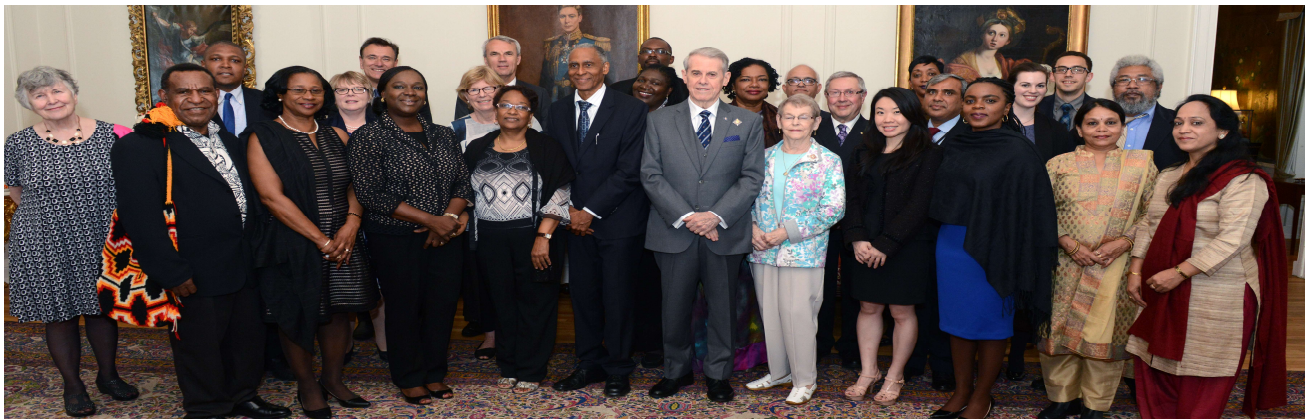
Participants at Government House, Halifax

The evaluations received from the participants were very positive. Many participants commented on the expertise of the facilitators, expressing a desire to delve further into many of the topics covered. Several commented on the usefulness of the materials and discussions, noting that the experience will serve as a solid resource in their home countries and can be adapted to accommodate different legal systems. Specifically, the participants praised the informative and diverse content of the course and felt that their attendance at the Intensive Study Programme would directly improve their ability to face the challenges of judicial education / judicial reform in their home jurisdictions.